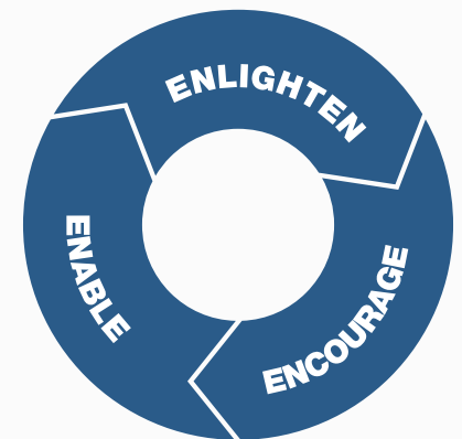
The Three Necessary Conditions for Initiating and Sustaining Successful Behavioral Change

Talent Accelerator is available with any Envisia Learning assessment – including those that are custom designed just for you. Before you buy any 360-degree assessment, be sure to learn more about how Talent Accelerator translates insight into increased effectiveness and greater ROI for your program. Just visit our website at www.envisialearning.com .